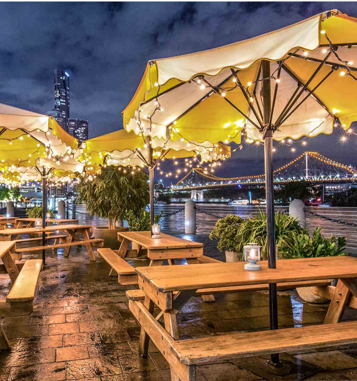
FRONT DECK Max 100 seated & standing