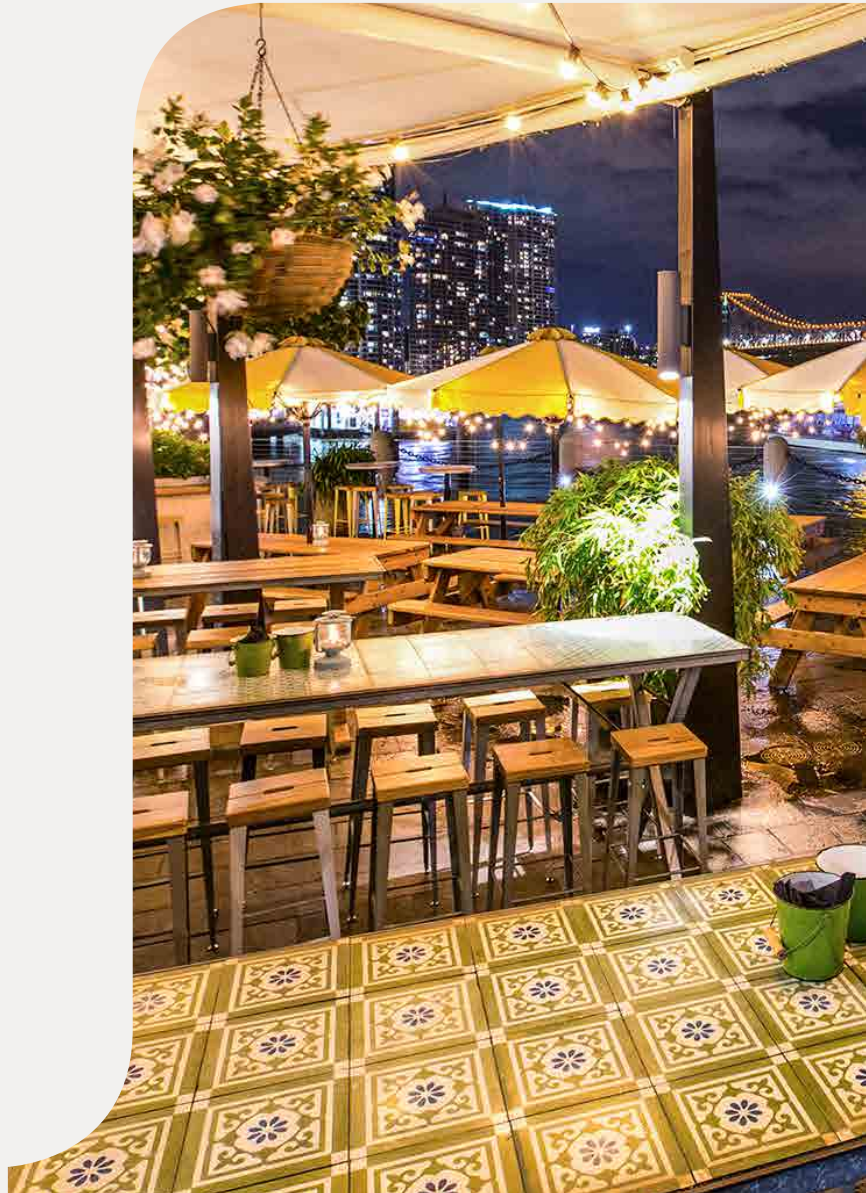
SAIL LOFT Max 50 seated & standing