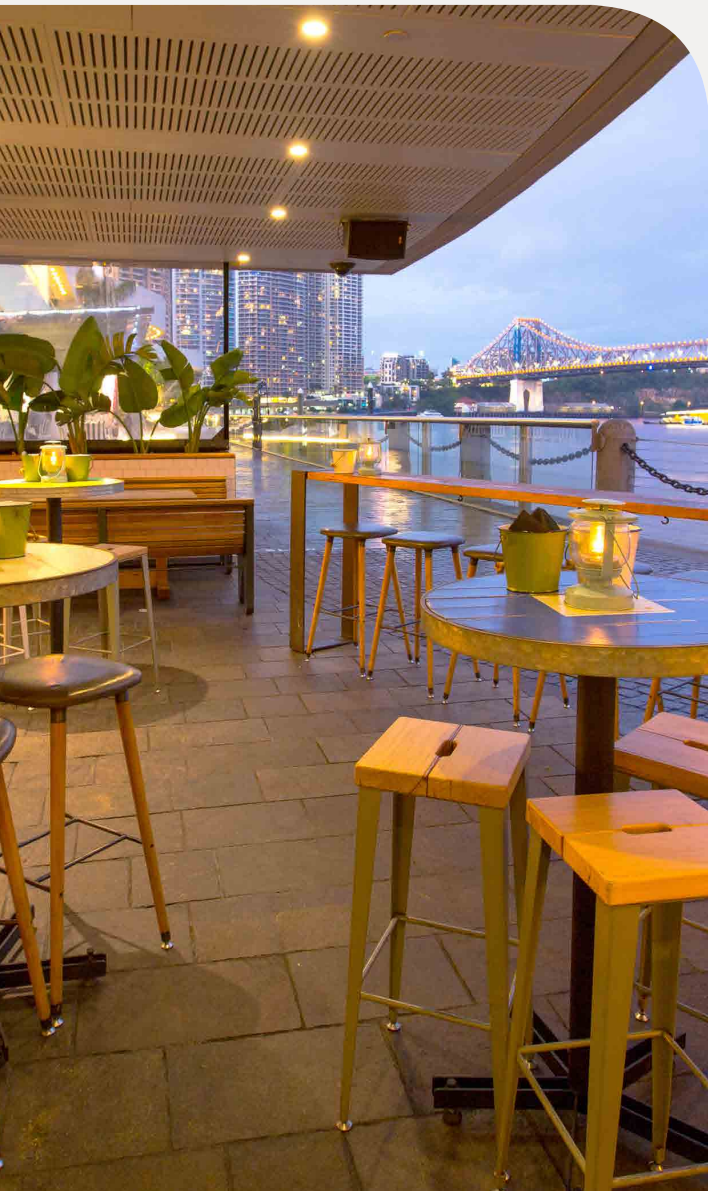
THE PROMENADE Max 70 standing & minimal seating